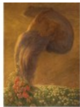
Gaetano Previati Il sogno (El sueño), 1912 Oleo sobre lienzo Colección particular

Organised by Fundación MAPFRE in collaboration with MART (Museo di arte moderna e contemporanea di Trento e Rovereto)